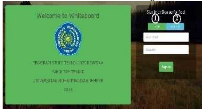
Figure 4 Home webboard

The result webboard home as seen at figure 4 below.