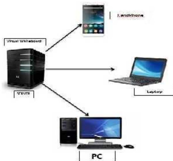
Figure 3 Client Server Topology Client

In Figure 2 can be explained that there are flowchart virtual whiteboard system in general. Can be explained that the first step in a virtual whiteboard system in general is input user ID and password into the system, the next step is the system will read the ID and password that have been fed with correction of ID and Password. If the ID and password are correct, the system will directly enter the web dashboard, and when the ID and password is not correct then the system will loop back to the login input. Use-case diagram to explain feature of the system as seen as people who are outside the system or actor. The design process that occurs in virtual whiteboard system can be described in the figure 2. This system topology is the topology that is used to run virtual whiteboard where this topology there is a server and client, the server uses a computer that serves the client computer requests by providing resources such as more memory, hard drives with high capacities. The topology present in figure 3 below.