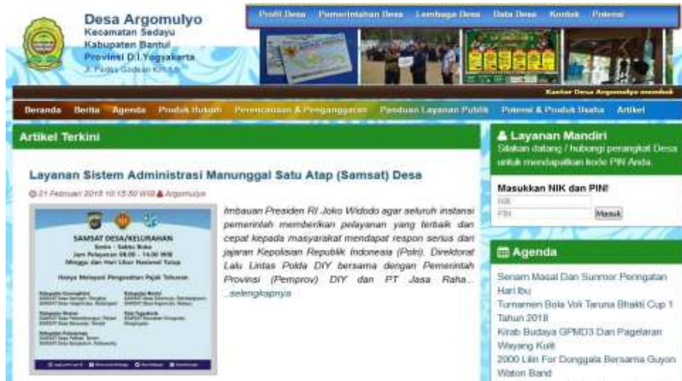
Image 3.1 Argomulyo Village Website

Reference : http://argomulyo.bantulkab.go.id