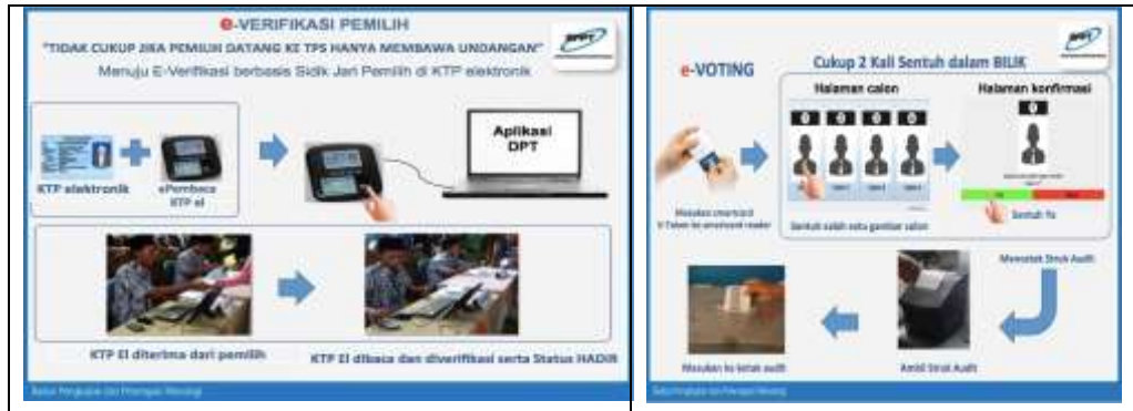
Figure 1. Voter e-verification and e-voting

voting system; (4) Computer generators equipped with touch screen computer monitors with candidates in the voting booth. There is also a feature to repeat if the choice is to be replaced or abstention; (5) Thermal printers, namely a choice of paper printer. Without voter identity, this receipt paper is included in the Audit Box to be collected, stored and guaranteed confidentiality. This Audit Box is only opened if a dispute occurs.