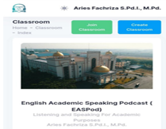
Figure 1. EASPod display in computer

activities that emphasized to students' fluency and pronunciation (Baratova, 2023). This will assist the listener to identify the word or sentence by podcaster.