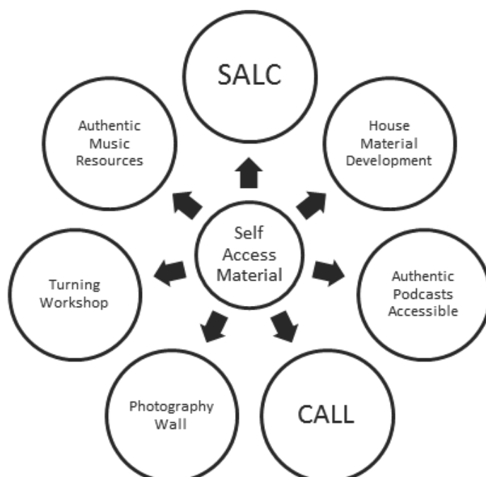
Figure 1. Parts of Self Access Material in Teaching ESP

The SALC also runs activities such as workshops, competitions, and events. All of these are enabled by a team of administrative staff, professional learning advisors, and